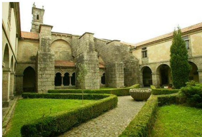
The Church and cloister of the Colegiata de Sar

We start at the Colegiata de Sar , the oldest parish church in Santiago, which sits on the Vía de la Plata (also known as the Camino Mozárabe ) – the route from Sevilla, 1000 kms to the south.