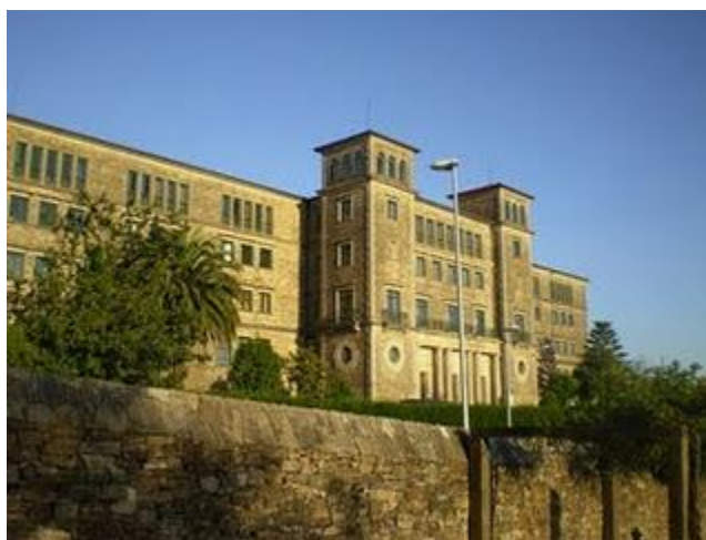
The Seminario Menor

The full title of the Seminario is “La Asunción Minor Seminary Hostel”, as it operates both as a seminary and as a school, and provides lodging for pilgrims.