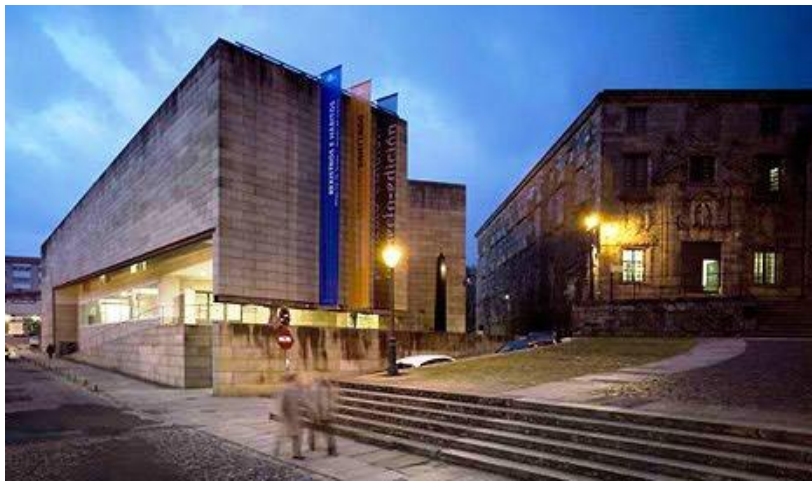
Galician Centre of Contemporary Art and the Museo do Pobo Galego

Camino Francés pilgrims continue straight on ahead into the centre of the city, but we turn sharp R at the Porto do Camiño traffic lights, onto the Costa de San Domingos . Enter the parque de San Domingos de Bonaval by the zona peatonal , between the CGAC (Galician Centre of Contemporary Art) and the Museo do Pobo Galego/Iglesia de San Domingos de Bonaval . This is the “Museum of Galicia”. It is open Tuesday to Friday from 10.30am – 2pm and 4pm – 7.30pm, as well as Sundays from 11am – 2pm. NB The museums are closed on Mondays. There are toilets and an excellent restaurant with an open-air section adjoining the route.